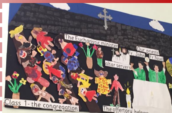
Class 1 made this beautiful hall display to depict 'People who help in Church'